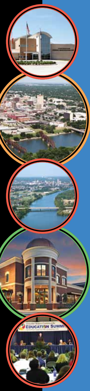
Education Summit... Greater Waco Chamber of Commerce... Brazos River... Downtown Waco... MCC Emergency Services Education Center...